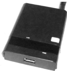
Viewbiquity Edge Gateway